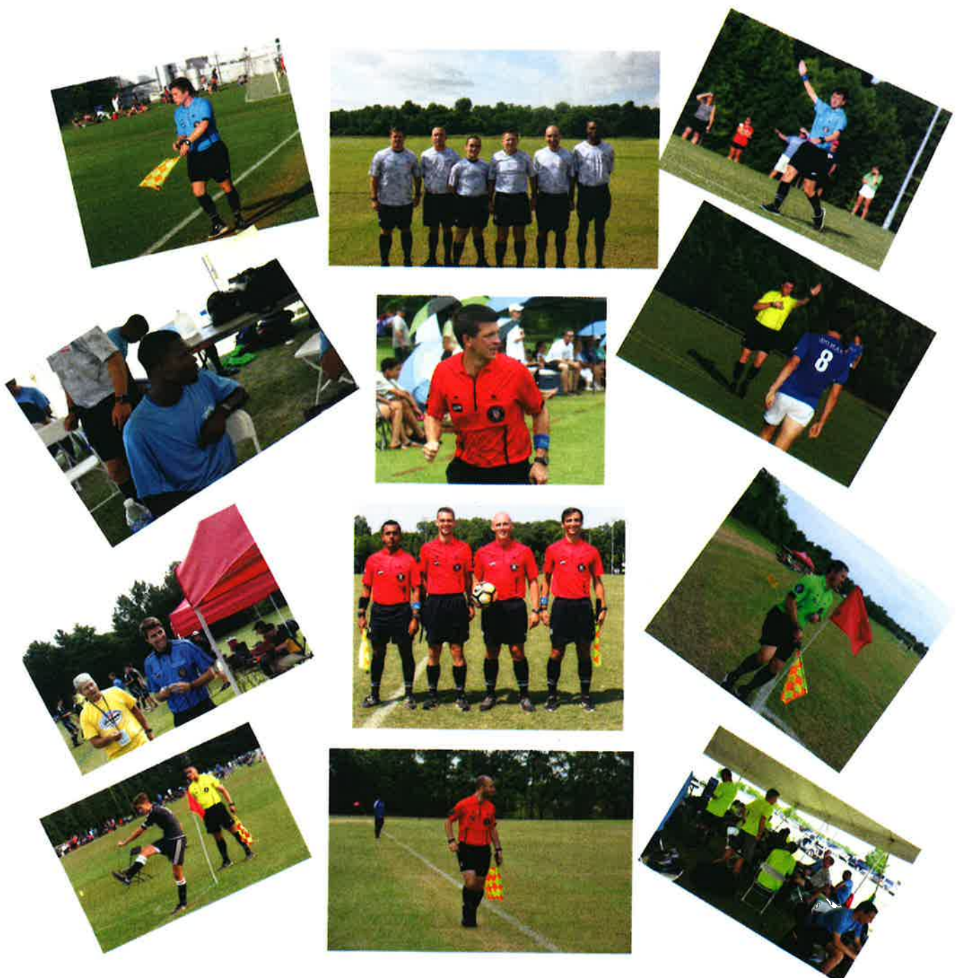
My sincerest apologies to Anyone who was not included in this Photo Array!

REMEMBER.....IF YOU INTEND TO UPGRADE FOR THE 2018 YEAR, YOU TAKE THE RECERTIFICATION TEST FOR YOUR NEW GRADE! YOU ALSO NEED TO FORWARD ALL YOUR INFORMATION TO THE SRA, SYRA, AND SDA TO LET THEM KNOW YOUR INTENT!