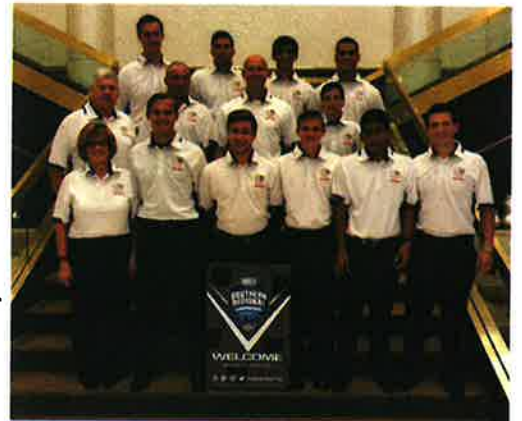
Alabama Delegations to USYS Region III Championships